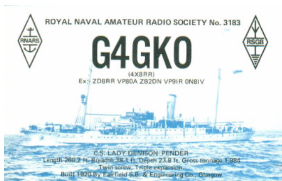
One of Ron's QSL cards, showing a cable ship